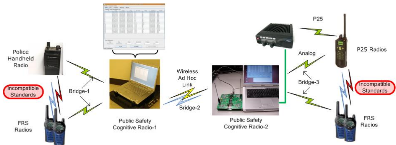
Figure 4 – Some Interoperability Functions Provide by CR.

Third, we implement a Radio-over-IP link which bridges two radios through a WiFi network. We use two CR nodes to bridge two legacy radios to the WiFi network respectively. In the demo, two conventional radios will use different channels to talk to each other; our cognitive radios work as gateways and enable the communication link through a WiFi network.